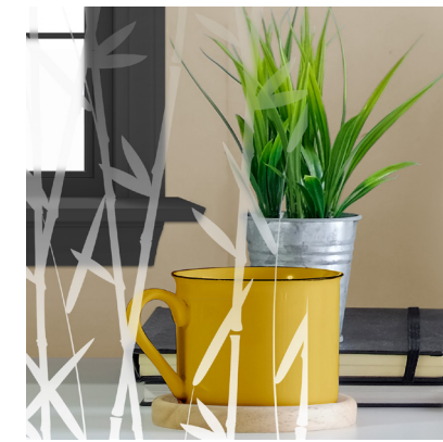
WHITE INK CUSTOM GRADIENT ON CRYSTAL

(DSF) is 40% black ink printed on etch film. The desired pattern is printed in a positive image, providing a decorative effect. The graphic is not see-through, but allows for the transmission of light & shadows. ***Most-private