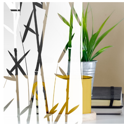
PRIVACY WHITE INK CRYSTAL

(PGF) is our trademarked simulated faux etch ink printed on clear film. The desired pattern is printed in a negative image, providing a privacy effect. **Semi-private