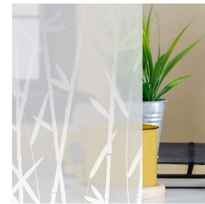
WHITE INK CUSTOM GRADIENT ON ETCH

(PSF) is 40% black ink printed on etch film. The desired pattern is printed in a negative image, providing a privacy effect. The graphic is not see-through, but allows for the transmission of light & shadows. ***Most-private