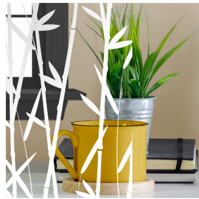
DECORATIVE WHITE INK CRYSTAL

(DGF) is our trademarked simulated faux etch ink printed on clear film. The desired pattern is printed in a positive image, providing a decorative effect. *Least-private