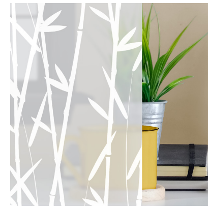
DECORATIVE WHITE INK ETCH

(DWC) is 100% opaque white ink printed on clear film. The desired pattern is printed in a positive image, providing a decorative effect. *Least-private