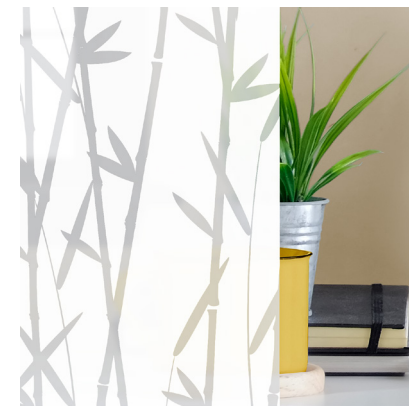
PRIVACY WHITE INK ETCH

(PWC) is 100% opaque white ink printed on clear film. The desired pattern is printed in a negative image, providing a privacy effect. **Semi-private