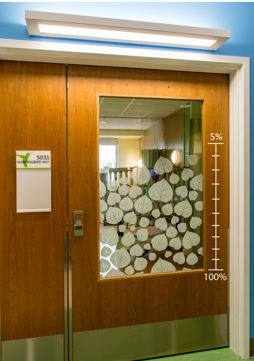
White Ink Custom Gradient on Crystal Film

The gradient on our White Ink Custom Options can be adjusted to achieve the desired level of privacy required for your space and application. White Ink can be printed on Crystal or Etch film, increasing the options and allowing for various levels of privacy. The higher the gradient level, the more opaque the ink is. 100% gradient allows no visibility through the ink and is 100% opaque. As the gradient level decreases, more visibility through the ink is achieved. The scale below is representative of the high level of privacy you can achieve with White Ink - the rendering is for illustrative purposes only and actual appearance will vary depending on the light source, background colors and images. Please contact your Olee representative for samples that can show you exactly what can be expected with our White Ink Custom Options.