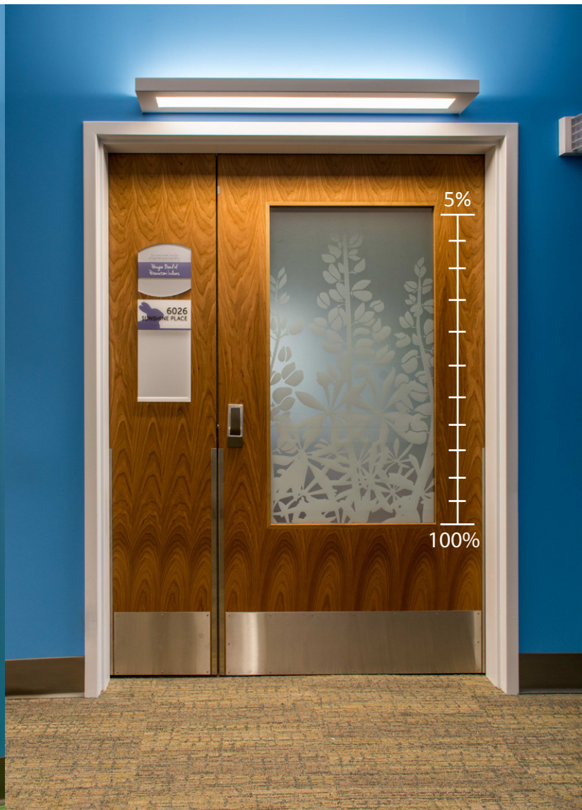
White Ink Custom Gradient on Etch Film